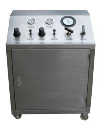
Model B closed type with stainless steel material