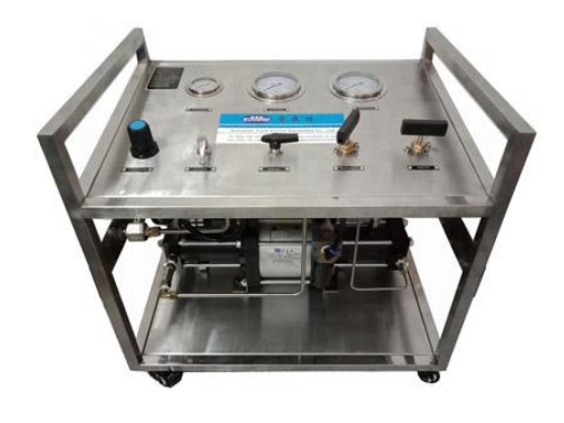
Model C frame type with stainless steel material