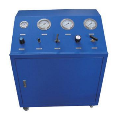
Model A closed type with carbon steel material